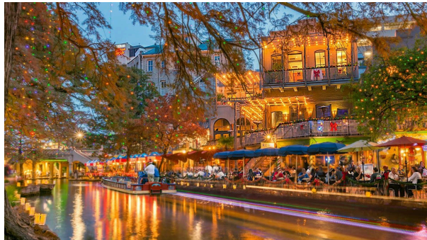
Fiesta de las Luminarias in San Antonio