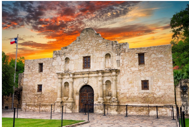
Alamo in San Antonio